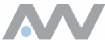
AMC-Europe - Alliance Mondial du Cinéma