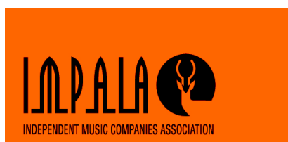
IMPALA - Independent Music Companies Association